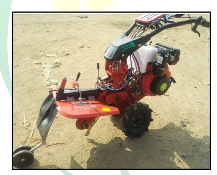
Pic: Front Rotary Power Weeder