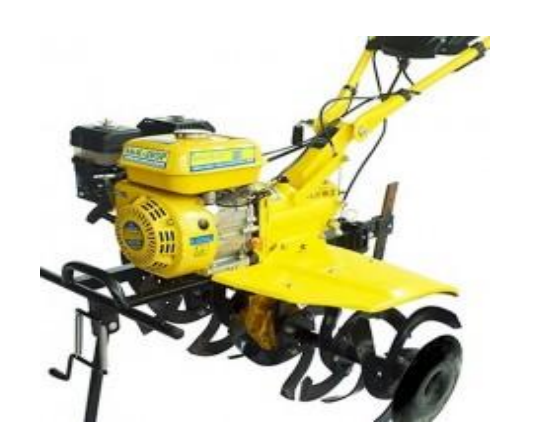
Pic: Gear Drive Power Weeder